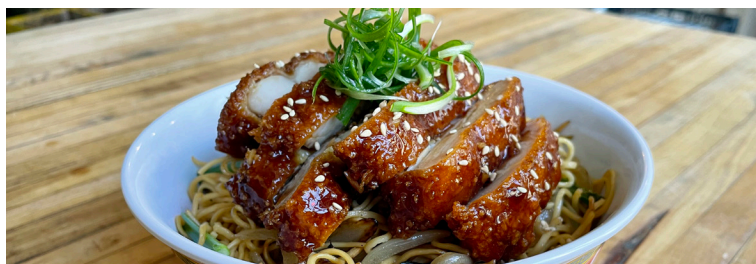
Pan-fried noodles with crispy chicken 14 Noodles stir-fried with scallions and onions and topped with crispy chicken