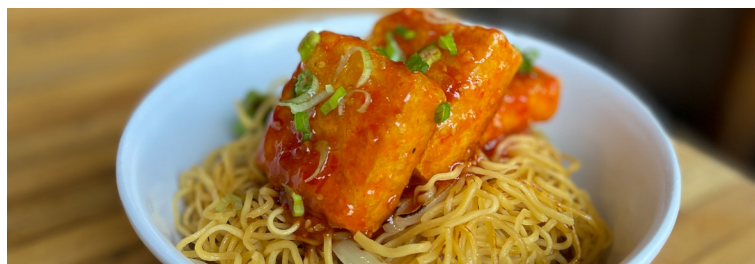
Pan-fried noodles with sweet chili tofu VG 14 Noodles stir-fried with scallions and onions and topped with sweet chili tofu