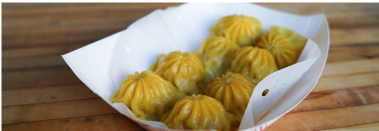
Chicken soup dumplings Chicken dumplings filled with soup