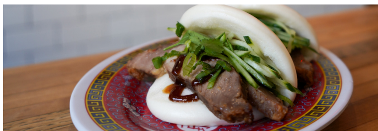
Char siu pork buns 12 Steamed buns filled with hoisin, cucumbers, scallions, cilantro, and char siu (2 pieces)

Please be aware that our food may contain or come into contact with common allergens, such as dairy, eggs, seafood, shellfish, peanuts, wheat, soy, and sesame. If you have a food allergy, please notify us.