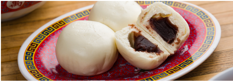
Steamed red bean buns v Dessert buns with red bean filling (3 pieces)