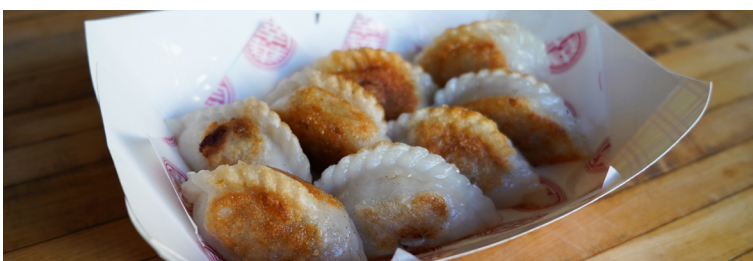
Pan-fried pork and shrimp dumplings Pork and shrimp wrapped in wheat wrappers