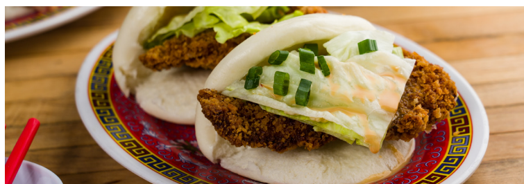
Crispy chicken buns 10 Steamed buns filled with panko-crusted chicken, iceberg lettuce, scallions, and creamy sesame sauce (2 pieces)