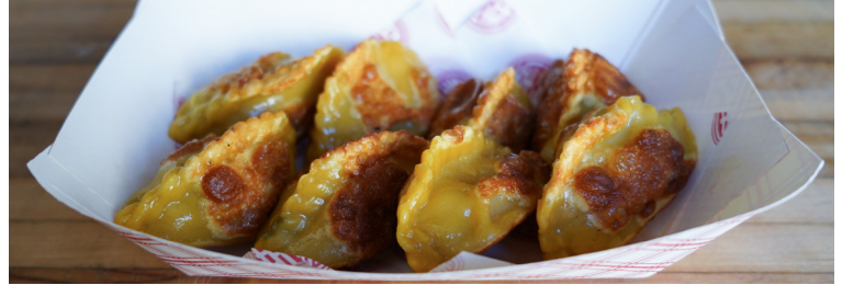
Pan-fried chicken and cabbage dumplings Chicken and napa cabbage in wheat wrappers