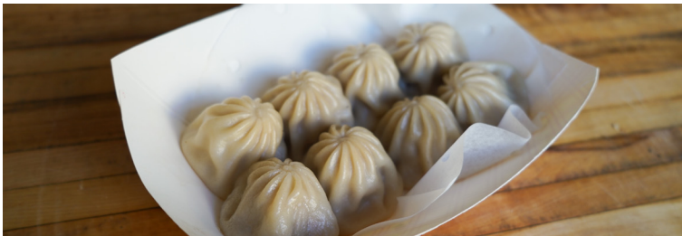
Pork soup dumplings Pork dumplings filled with soup