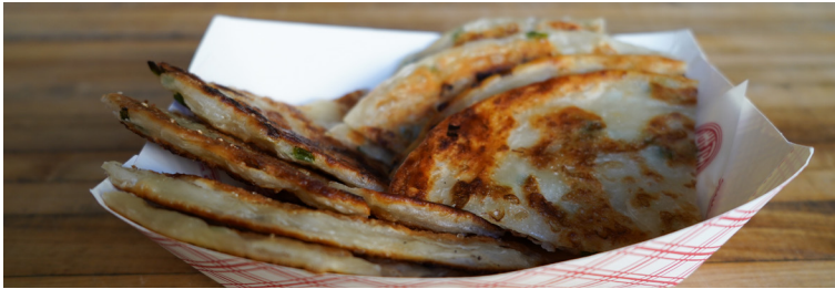
Scallion pancakes ♡ Wheat flour batter mixed with scallions