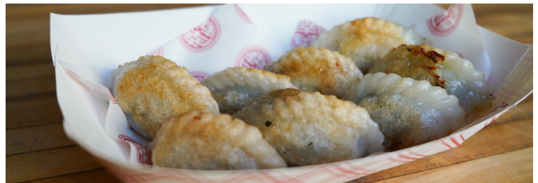
Pan-fried chive, pork, and shrimp dumplings Minced chive, pork, and shrimp in crystal wrappers