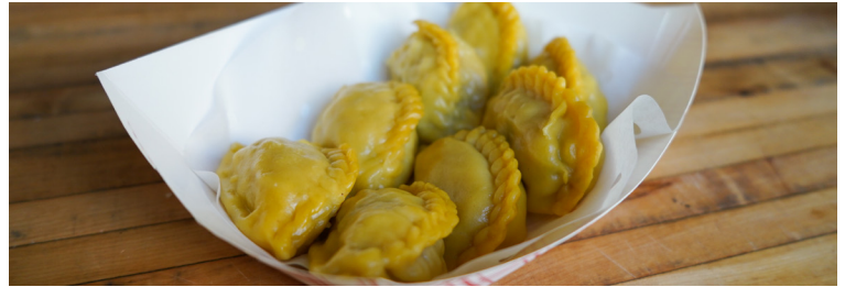
Steamed chicken and cabbage dumplings Chicken and napa cabbage in wheat wrappers