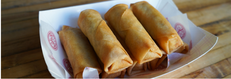
Crispy vegetable spring rolls ♡ Mixed vegetables, rolled in a thin flour wrapper