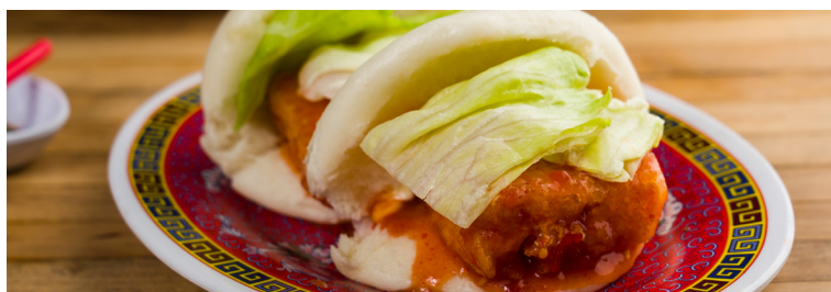
Sweet chili tofu buns VG 10 Steamed buns filled with sweet chili glazed tofu, lettuce, and kewpie mayo (2 pieces)