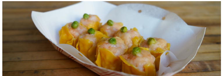
Shrimp siu mai Minced shrimp in wonton wrappers