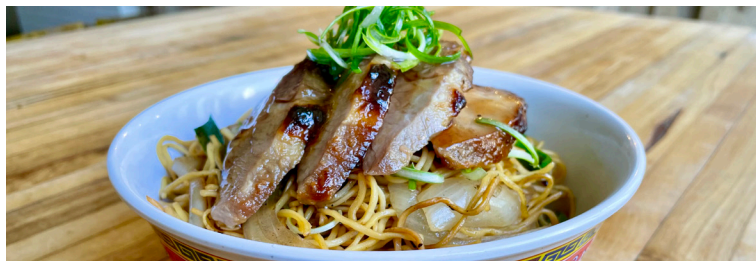
Pan-fried noodles with char siu pork 16 Noodles stir-fried with scallions and onions and topped with char siu pork