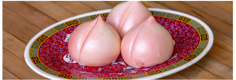
7 Peach buns v 7 Steamed dessert buns with lotus paste filling (3 pieces)