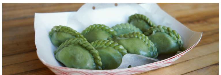
Edamame and Chinese chive dumplings ♡ Edamame, mushrooms, and Chinese chives in wheat wrappers